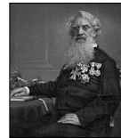
Samuel Morse (1791-1872)